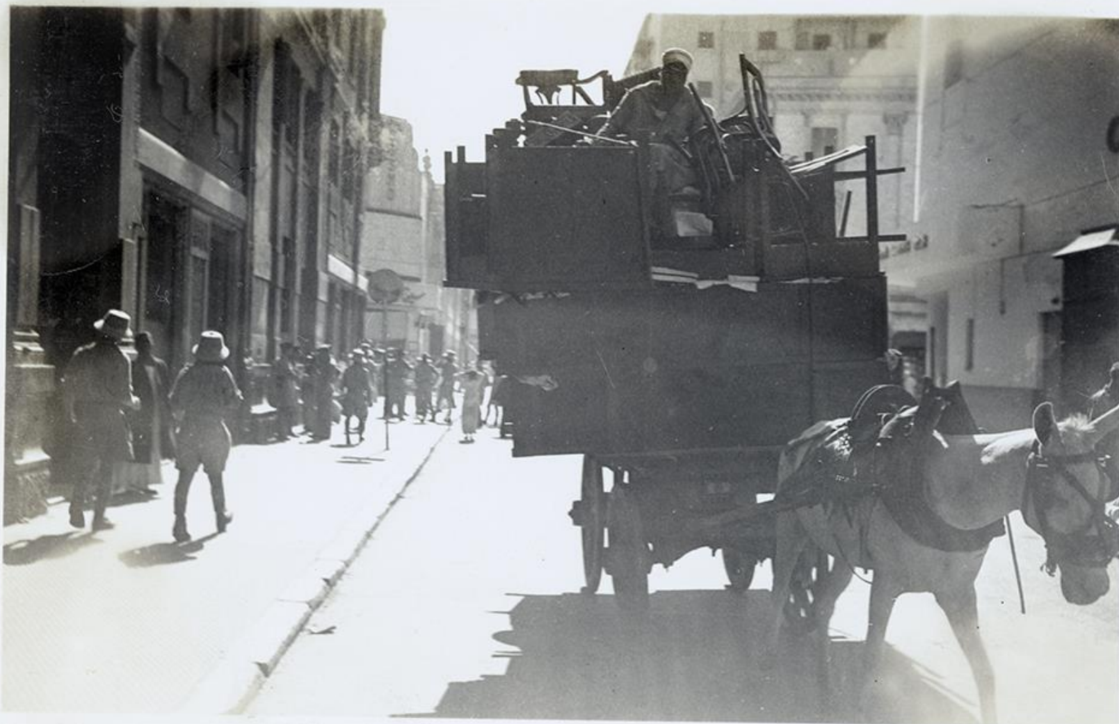
Soldiers walking down a street where a donkey is pulling a laden cart, Halwan, Egypt, c1941.