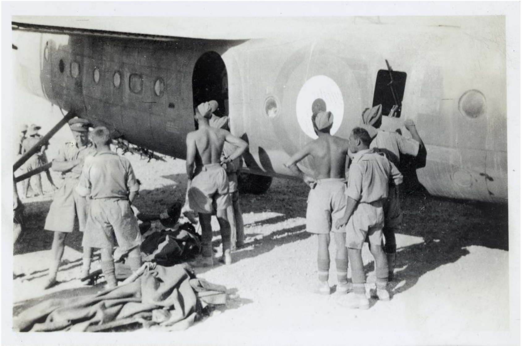
Loading wounded soldiers into an evacuation aircraft, El Alamein, Egypt, 1942.