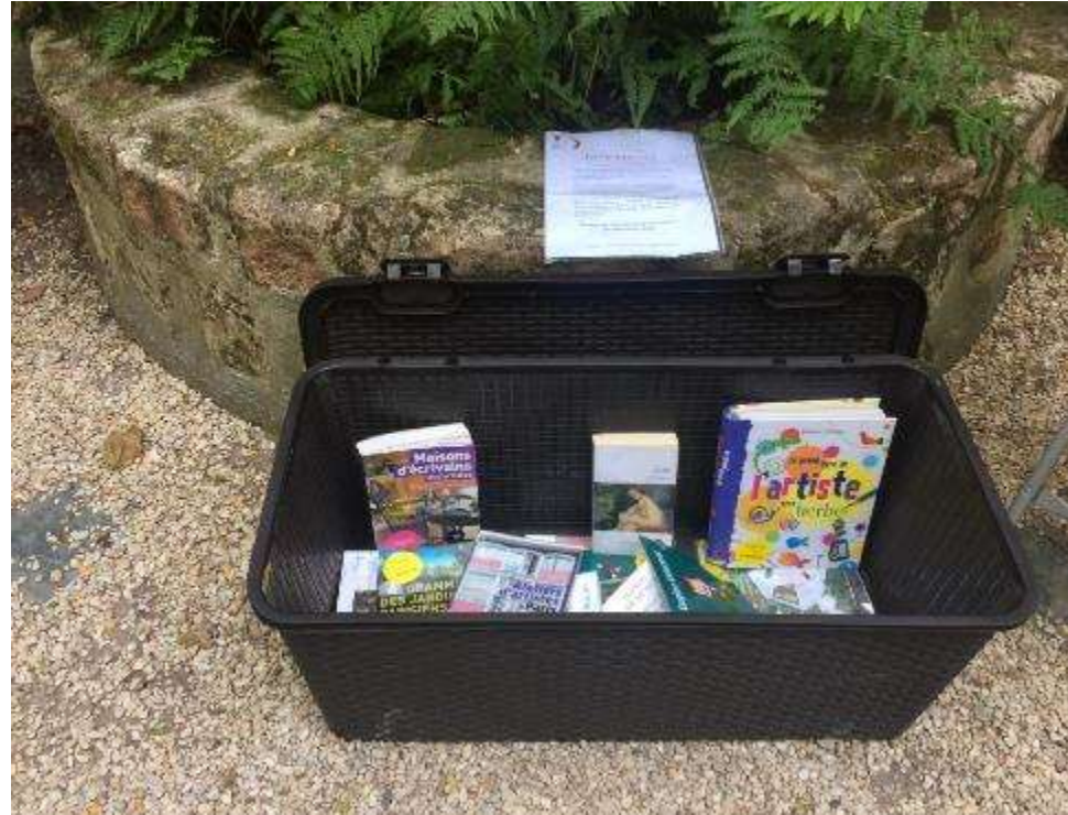
The private garden at Musée Delacroix, where visitors are invited to sit in the garden and read a book.