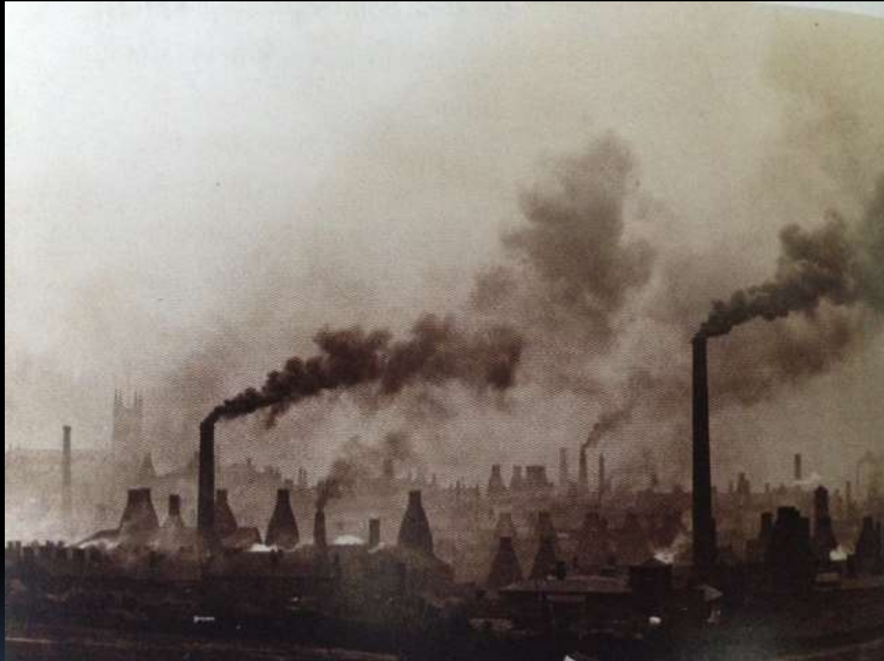
Longton, Staffordshire, C.1885