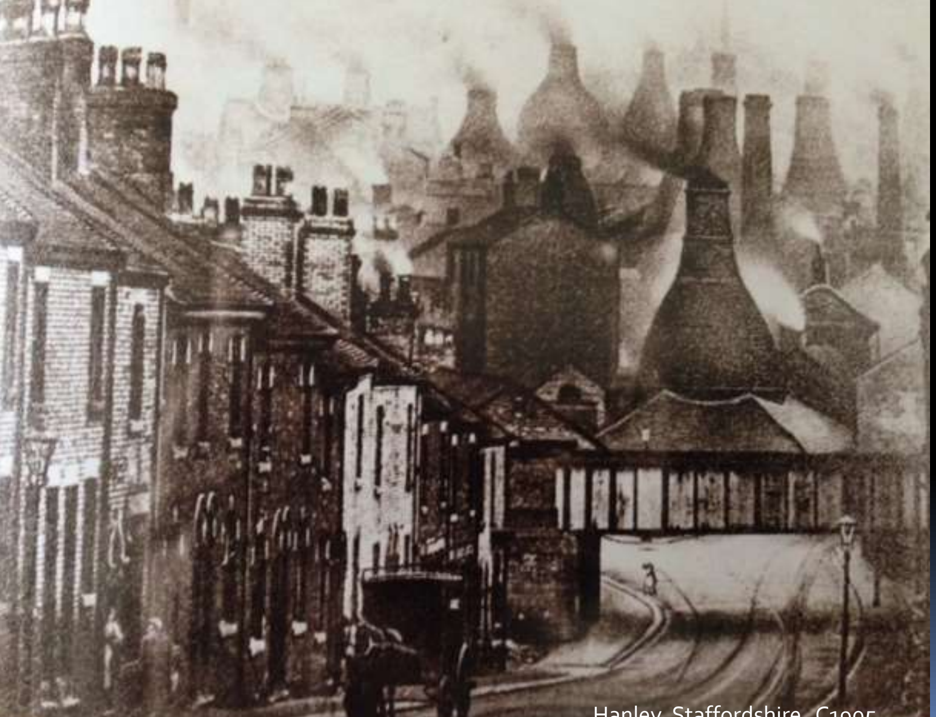
Hanley, Staffordshire, C1905