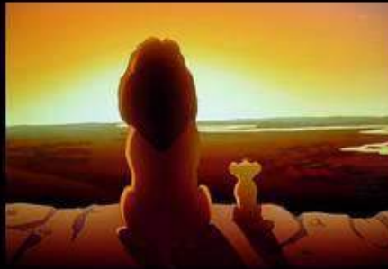
Where my white friends think I live