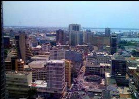
Where I really live