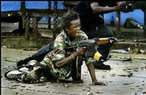
What my white friends think I do