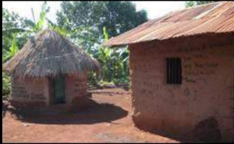
Where my black friends think I live