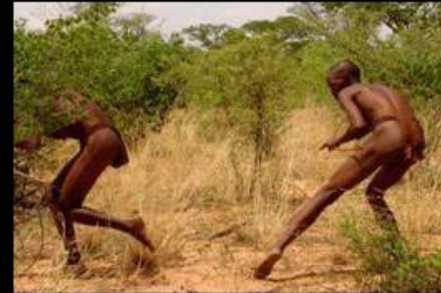
What my black friends think I do