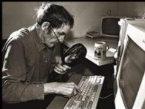
How we think we live with technology in South Africa.