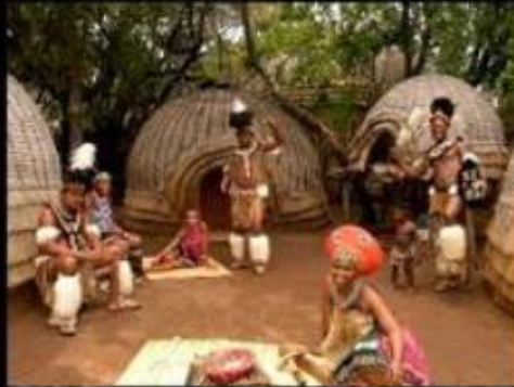
How the rest of the world thinks we live in SA.