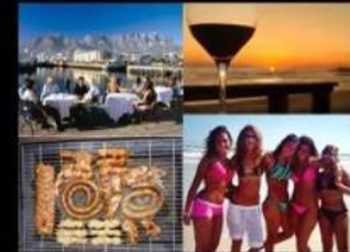
How South Africans really live in South Africa.