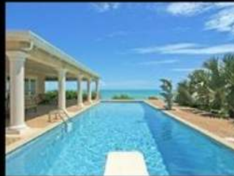
How tourists live in South Africa.