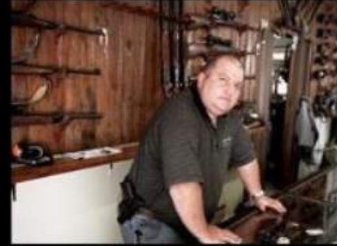
How ex South Africans in Australia say we live.