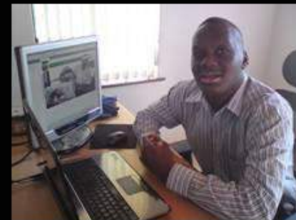
What I really do