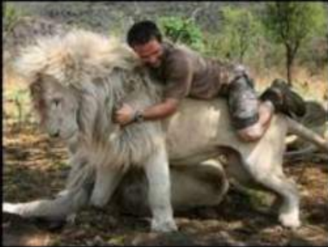
How the United States think we live in SA.